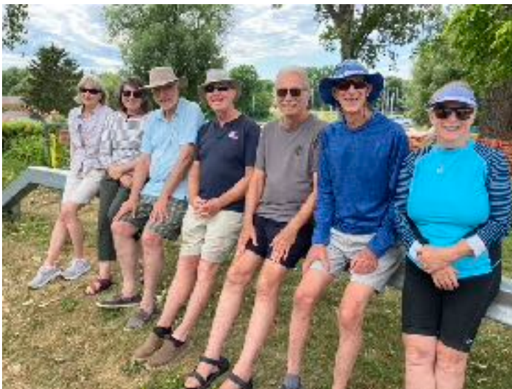
Waiting for the Homecoming Parade