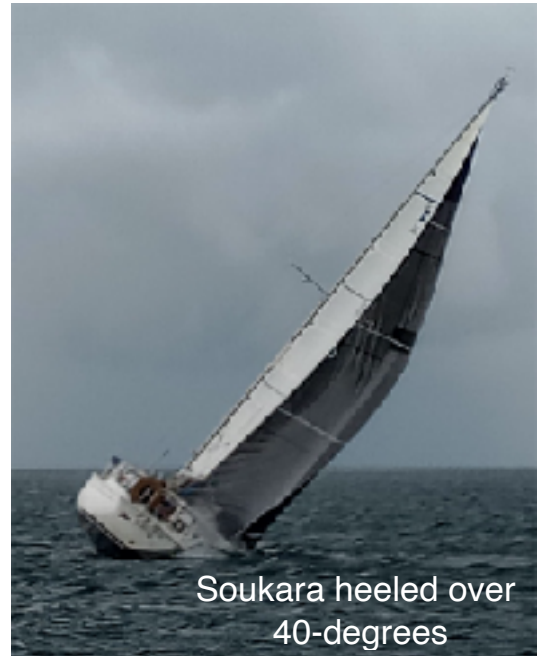
Soukara heeled over 40-degrees