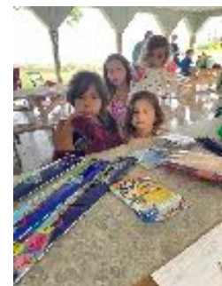
Prizes Move "indoors" as we all seek shelter And Mother Nature gets the Big Beautiful Finale