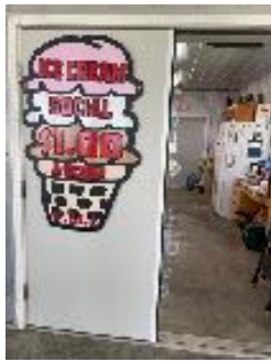
What a day!!! Ice Cream Social