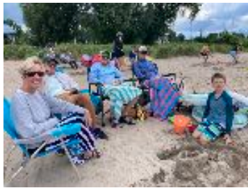
Then Kids' Sand Sculptures, cut short by Mother Nature's Tantrum