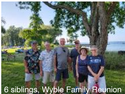
6 siblings, Wyble Family Reunion