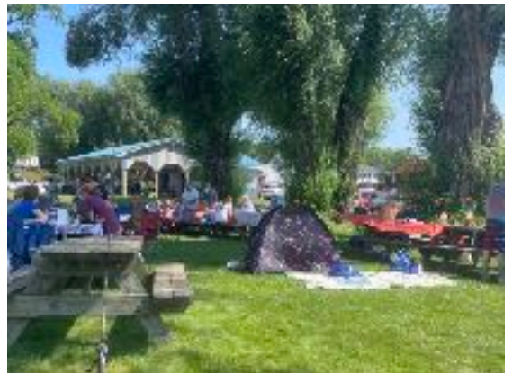
Forth of July Potluck Parking at a premium