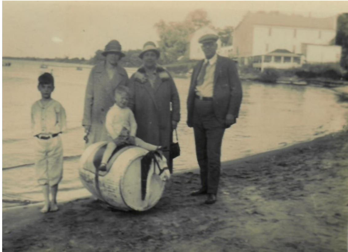
Earlier times along the shore. Circa 1930.