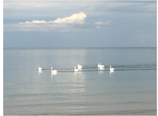
8 Swans a Swimmin'