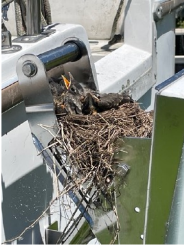
Hungry Family moves on to Ed & Becky Casalmir's boat