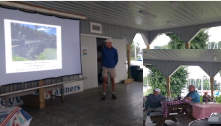
“Windows on the World” Movie Night