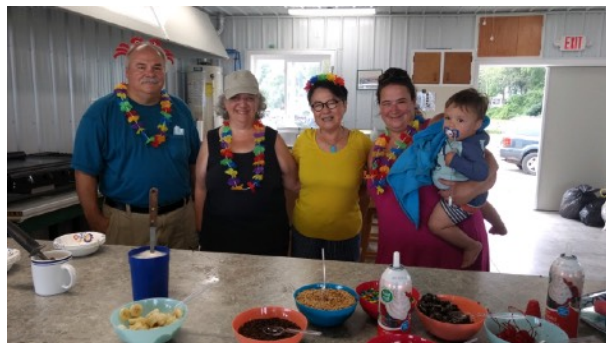
Ice cream Social