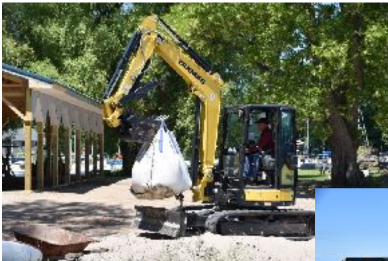
Sand Bags re-used

Thanks to the PMI members for their help and assistance. Together we will have a great place to sail, relax, and party.