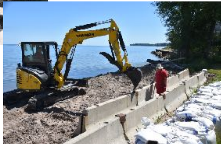
Jersey Barriers repositioned to protect Sail Sheds and create passage for Board Boats