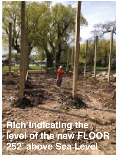
Rich indicating the level of the new FLOOR 252' above Sea Level

They were not too heavy! The posts were trued during this process. When lunch time came around, they decided to complete setting the trusses which took about an extra hour. A short lunch and back to the roof for valley jacks, purlins, corner blocks, wind bracing and fascia.