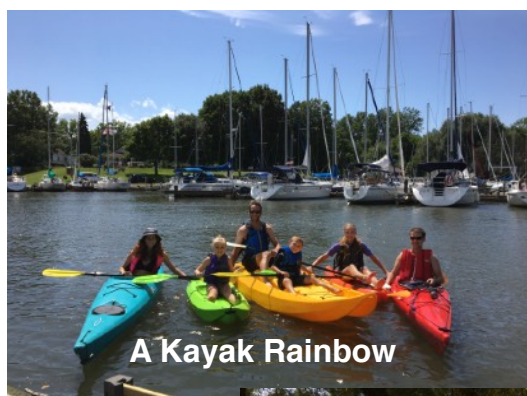
A Kayak Rainbow