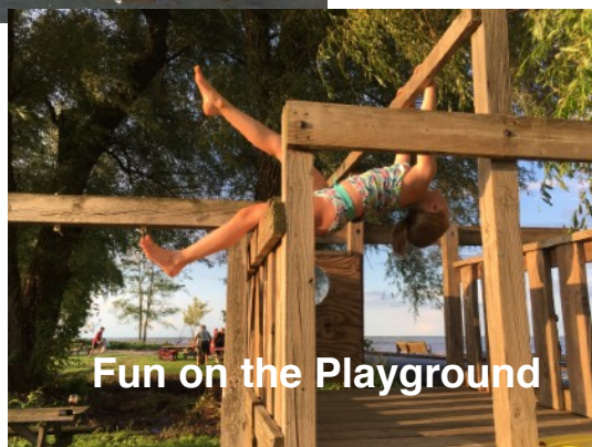
Fun on the Playground