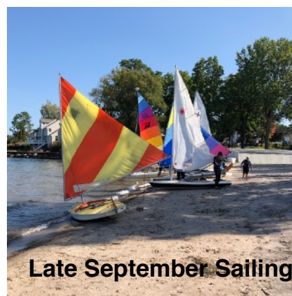
Late September Sailing