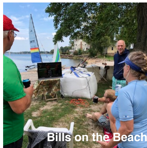
Bills on the Beach